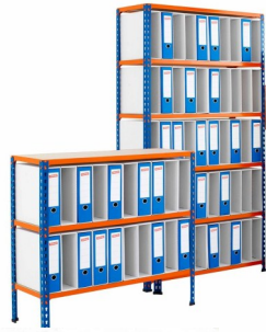
Adjustable Light Weight Storage Rack